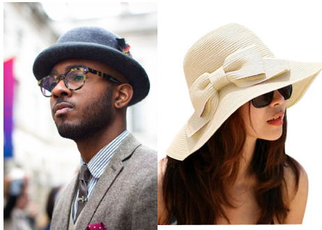
Hat $30 Price for 1 Person