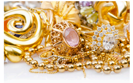
Jewelry $80 Price for 1 Person