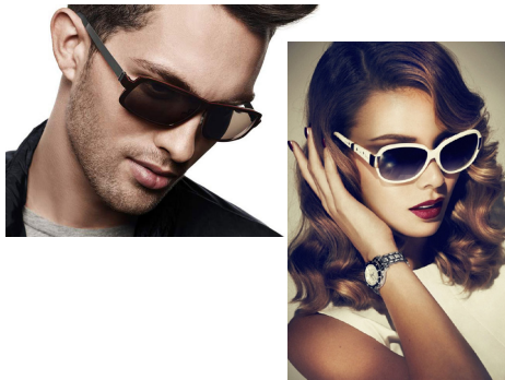
Prescription Sunglasses $350 Sunglasses $60 Price for 1 Person