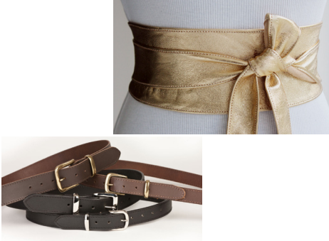
Belt $20 Price for 1 Person