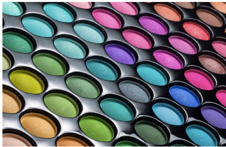
Makeup $80 Price for 1 Person