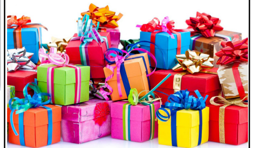
Gift $35 Price for 1 Person