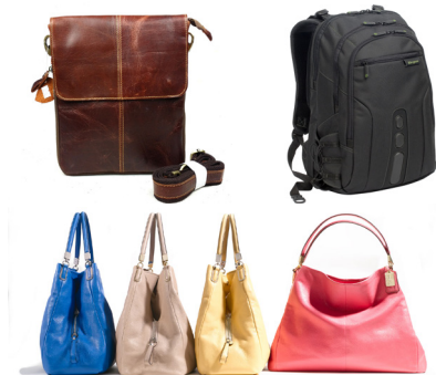
Purse/Bag $65 Price for 1 Person