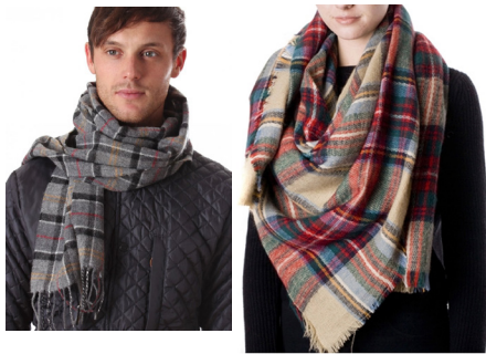
Scarf $15 Price for 1 Person